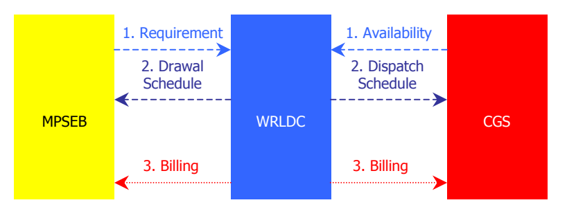
Figure 1: ABT Operation and Billing & Payment Mechanism Prior to Open Access.